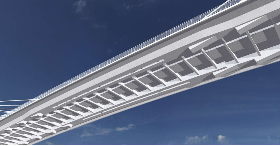
Midspan framing showing the double edge girders with the anchors tucked between them to provide the navigation clearance in the middle of the bridge. Rendering: T.Y. Lin International.

and recess the anchorage between the split edge girders. This design produced a somewhat complicated forming system, but it allowed meeting the clearance requirements without significantly increasing the concrete volume and weight.