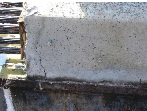
A cracked and spalled girder in the location of the bearing zone where wax was applied to the soffit.