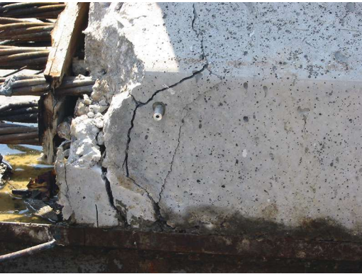
A cracked and spalled girder in the location of the bearing zone for the case of an untreated soffit.