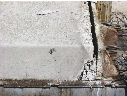
A cracked and spalled girder in the location of the bearing zone. In this case, a Teflon pad was placed between the girder and the soffit.