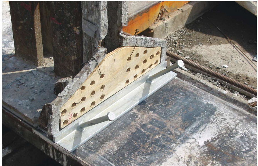
Steel angle positioned to be embedded in girder end.

There is good reason to believe that not every girder needs a bearing plate to protect it from tearing and spalling. Recall that the problem was not prevalent when AASHTO girders were the predominant shapes in use, but developed with the advent of deep bulb tees and the use of 0.6-in.-diameter strand.