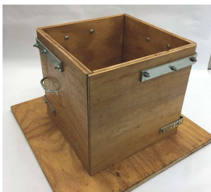
The box test evaluates how a concrete pavement mixture responds to vibration and provides a more accurate assessment of workability than the slump test.

Implementation efforts are vital to moving agencies toward a performance specification