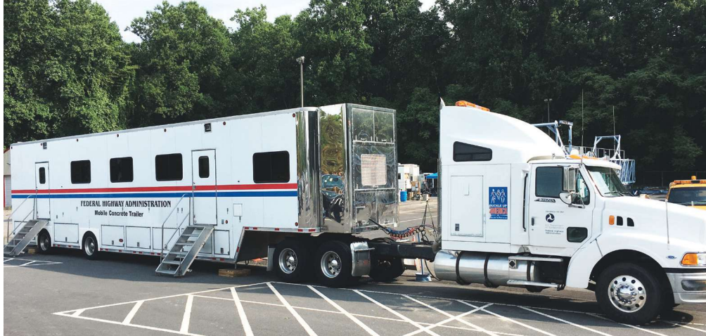
The Federal Highway Administration's mobile concrete trailer assists states across the country with implementing new concrete technology.

float test, provides an indication of the finishability of structural flatwork concrete.