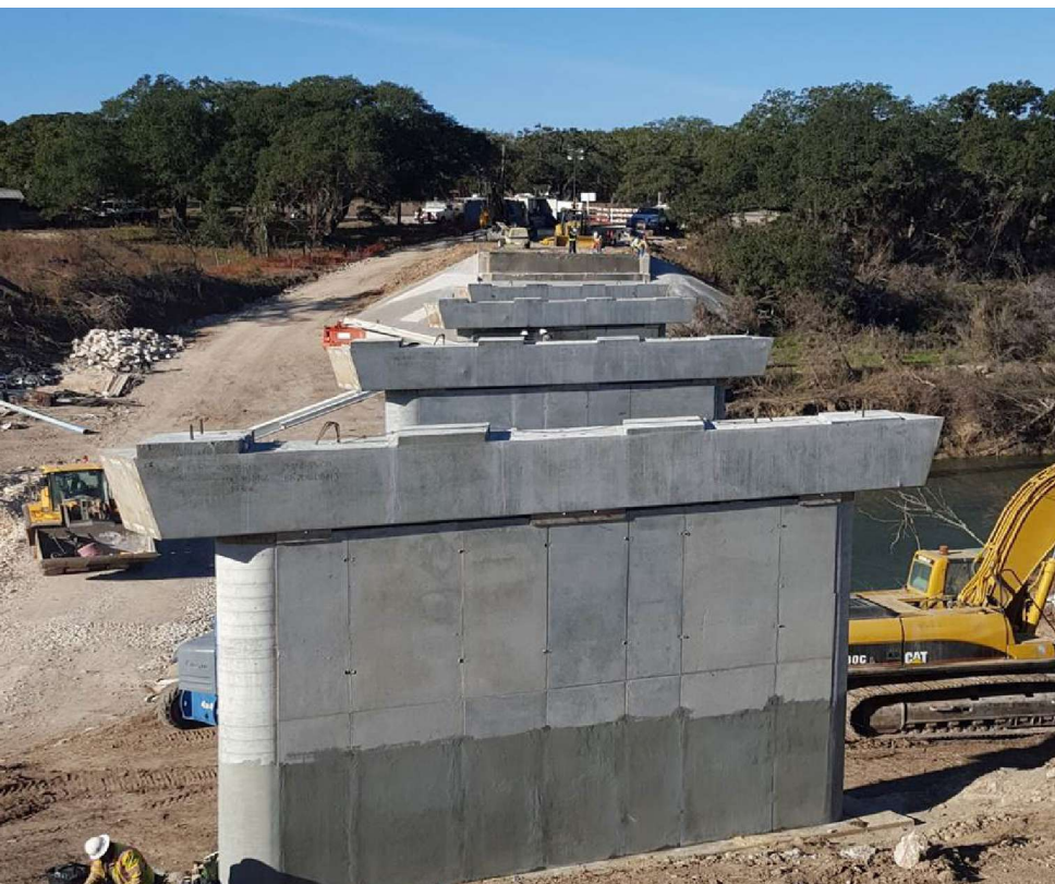
Prestressed, precast concrete bent caps (PPBCs) at Fischer Store Road in Hays County. The contractor installed all of the PPBCs in one day.

using grouted vertical ducts. In this older-style connection, column reinforcement was terminated at the top of the column, and dowels extended from the top of the column through vertical ducts that were cast into the PPBC. Once the PPBC was placed on the columns, the ducts were grouted to complete the connection. In the TxDOT standard, the connection has been changed to a cap pocket. In the cap pocket connection, the column reinforcement is extended into a pocket in the PPBC that is formed with a corrugated metal pipe. Once the PPBC has been placed, the pocket is filled with TxDOT Class C or Class S concrete. This change