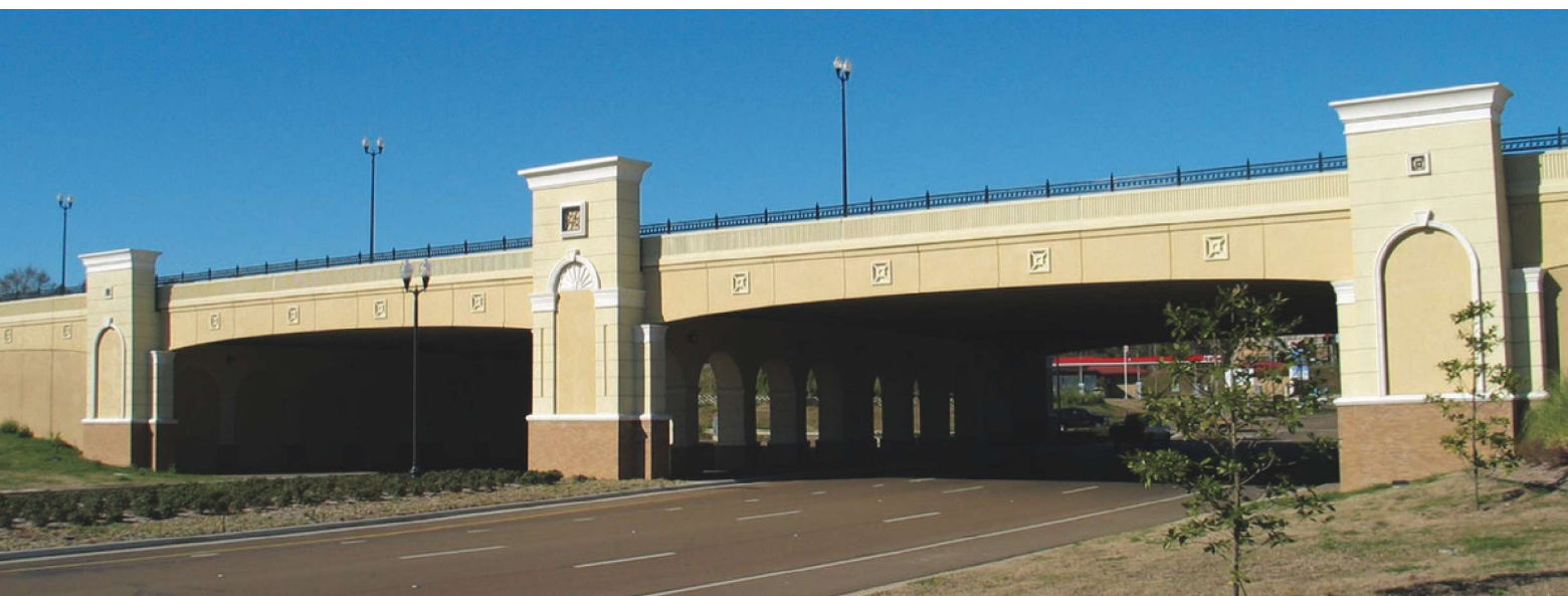
The U.S. Highway 61/84 Bridge over Liberty Road in Natchez, Miss., presents examples of precast concrete aesthetic panels and castings that the Mississippi Department of Transportation is able to add to bridges at a lower cost with a robust concrete industry in Mississippi.