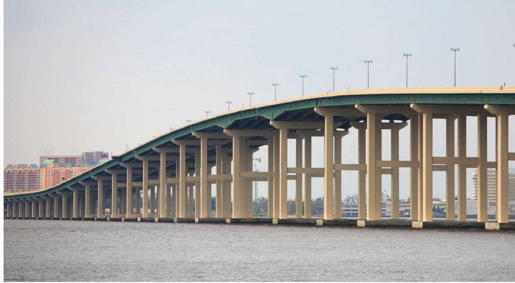
After being damaged beyond repair following Hurricane Katrina in August 2005, the new Biloxi Bay Bridge was completed in record time with prestressed concrete girder approach spans and haunched post-tensioned concrete girders for the main spans. The aesthetically designed new bridge features artwork from local artists and pedestrian lanes offering beautiful views of Biloxi, Ocean Springs, and the Biloxi Bay.

Each bridge is a fixed-span high-rise structure composed of prestressed concrete bulb-tee girders with a multispan, haunched, post-tensioned main span unit. The decks are cast-in-place (CIP) concrete and contain