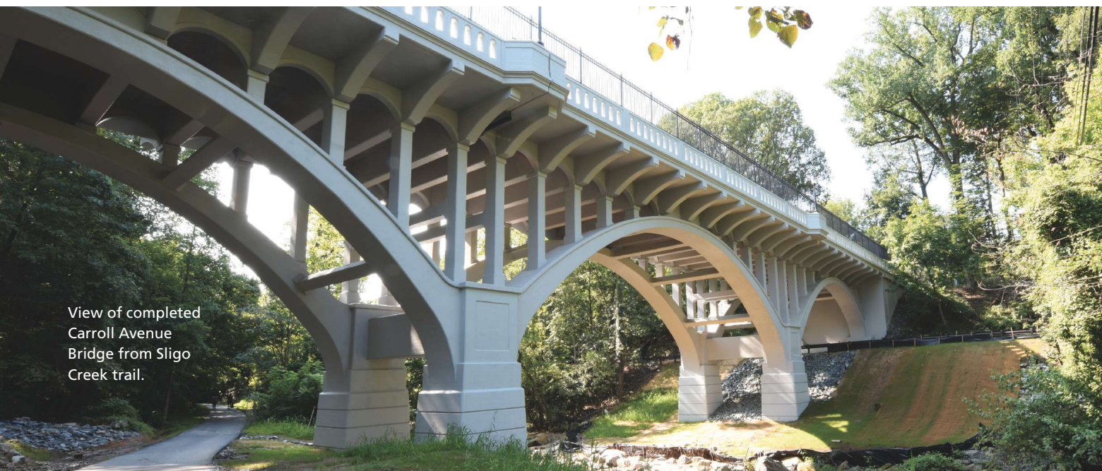
View of completed Carroll Avenue Bridge from Sligo Creek trail.