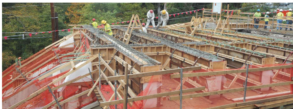
Concrete being placed for new floor beams at the top of one of the arches.

One of the construction innovations that made the project such a success was the prime contractor's use of a work platform at the elevation of the arch supports. This work/demolition platform consisted of steel beams and timber flooring supported by shoring towers 15 to 20 ft above the floodplain of Sligo Creek. This platform solved