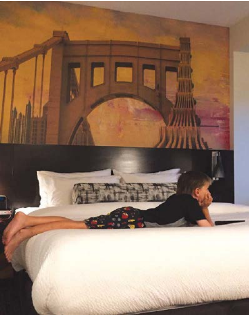
Yes, we are in Pittsburgh.