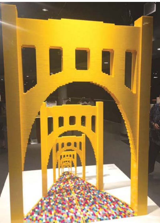
The symbol of Pittsburgh constructed from LEGO® pieces.

Last summer, my wife and I took our younger grandson on a tour of Pittsburgh, Pa. The big attraction was the dinosaur exhibit at the Carnegie Museum of Natural History. Of course, Pittsburgh is also known for its bridges, with more than 400 sizable bridges in and around the city. The decorator of our hotel must have had that reputation in mind when selecting an image of one of those bridges, the Roberto Clemente Bridge, to place on a wall in our room. The next day, we discovered that the Carnegie Science Center was hosting a LEGO® exhibit. That is a not-to-be-missed event if you are 8 years old. So, of course, we went. When we arrived, we found that the exhibit contained a LEGO® model of the very same bridge.