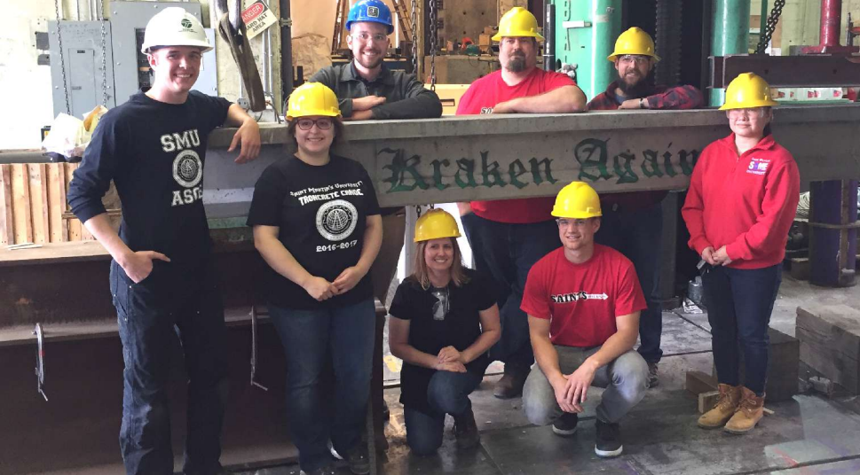
St. Martin University's 2017 PCI Big Beam Competition team prior to testing at the University of Washington structural engineering laboratory.

course requirements, and accomplishes many of the Civil Engineering Body of Knowledge outcomes. Students learn about team work by working together to accomplish competition requirements. They learn about project management by completing design activities to meet construction days that align with the fabricator's schedule. The teams sharpen their technical communication skills by producing a professional report, which includes team predictions and results (see Tables 3 and 4 ). After testing, assumptions for the initial predictions are reexamined and revised predictions are computed. The report includes calculations (math), written discussion on the structural design and the concrete mixture (design), and team member statements on what they have learned (lifelong learning).