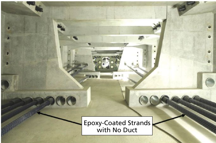
Figure 3. External tendons using epoxy-coated strands in a box girder. Strands are not enclosed in a duct except where they pass through diaphragms.

One significant advantage of the replaceable PT technologies mentioned here is that they can be designed to provide a larger replacement prestressing force, which could provide future benefit when addressing unanticipated issues.