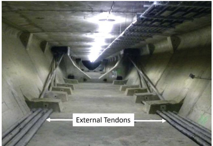
Figure 1. Typical external post-tensioning tendons in a box girder.

In the United States, interest in fully replaceable PT systems is a fairly recent trend, although