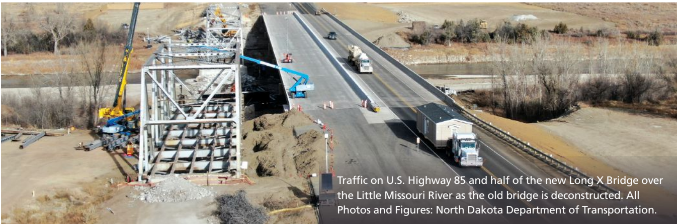
Traffic on U.S. Highway 85 and half of the new Long X Bridge over the Little Missouri River as the old bridge is deconstructed.

The new Long X Bridge is a five-span prestressed concrete girder bridge, which accommodates two 12-ft driving lanes in each direction, and a concrete median barrier. The four-lane bridge is designed to accommodate the heavier loads of today's truck traffic while also removing the original structure's horizontal and vertical clearance restrictions. The new bridge plays an integral role in the upcoming 62-mile, four-lane expansion project from Watford City to Interstate 94 on U.S. 85.