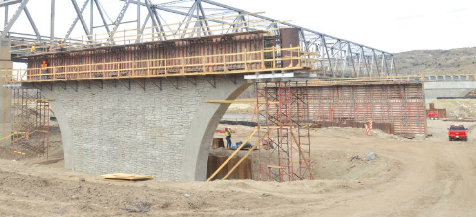
Pier construction on the new Long X Bridge.