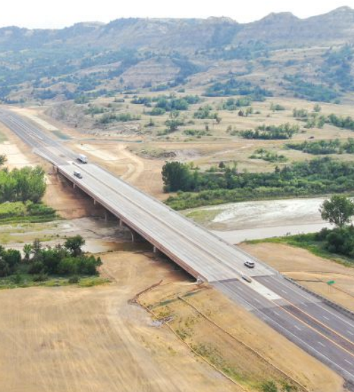
The completed new four-lane Long X Bridge on U.S. Highway 85 over the Little Missouri River. The temporary construction causeway has been removed and the river channel has been restored.