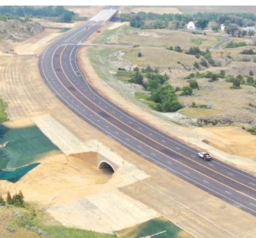
The replacement of the Long X Bridge was part of a $37 million North Dakota Department of Transportation project that included 1.77 miles of highway reconstruction as well as construction of North Dakota's first wildlife crossing built underneath U.S. Highway 85.

the inner shafts received less load than the outboard shaft, which attracted higher loading in a flowing ground scenario.