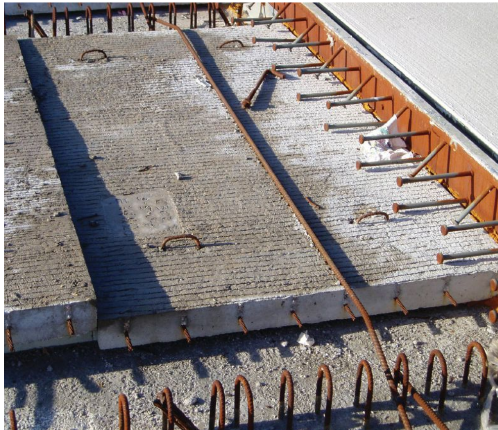
Figure 2. Installation of no. 5 top tension tie after installation of the 4-in.-thick precast concrete partial-depth deck panels. The tie is bent downward at each end to allow welding to projecting shear reinforcement. Deck panels at expansion joints are set 2 in. lower than typical panels to provide a thickened end for enhanced deck strength and stiffness.

With TxDOT's widespread use of precast concrete partial-depth deck panels for deck construction, there is a complication in the installation of the tension ties between girders, which are no. 5 reinforcing bars welded to the projecting shear reinforcement. These top tension ties are installed during beam erection, then later removed as needed to allow installation of the 4-in.-thick precast concrete deck panels. The ties are then reinstalled after panel installation is