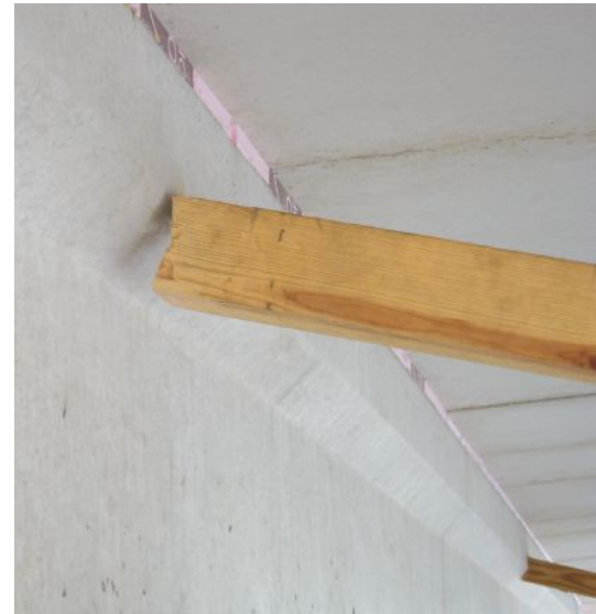
Figure 3. Timber X-bracing (left) was a required element in previous bracing standards for the Texas Department of Transportation (TxDOT). However, this bracing would sometimes lose contact with the girder due to fascia beam rotation during deck construction (right). The new TxDOT standard bracing detail uses horizontal timber bracing between the bottom flanges.

complete. During beam erection, the no. 5 tie is welded close to the top of the beam, providing a stiffer and more effective connection with the projecting shear reinforcement. After panel installation, the no. 5 reinforcing bars need to be bent down on both sides of the 4-in.-thick precast concrete deck panels to allow welding to the shear reinforcement (Fig. 2).