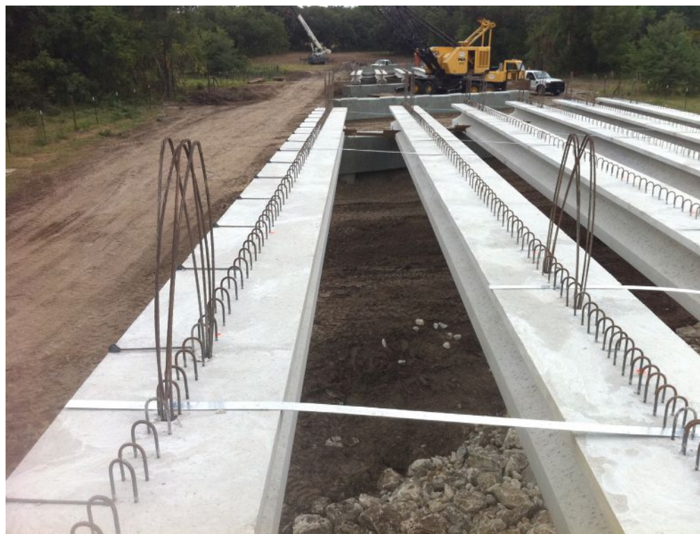
Figure 4. As an alternative to the no. 5 reinforcing bar welded to the girder shear reinforcement, a 12-gauge galvanized steel strap anchored to the top flanges allows installation of precast concrete partial-depth deck panels without removing and reinstalling the top tension tie.

A bridge identical to the bridge that put focus on this problem was constructed with the recommended horizontal bracing. This second bridge, with geometry and overhang loading essentially identical to the first bridge, performed as desired. TxDOT engineers measured girder rotation at each end of both fascia beams