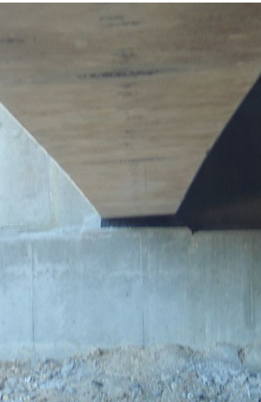
Figure 1. During construction of a single-span precast, prestressed concrete girder bridge for the State Highway 130 project, outward rotation of fascia beams resulted from deck construction. This photo was taken after removal of erection and slab placement bracing.

This troubling performance occurred despite the beam erection and slab placement bracing being installed in accordance with plan requirements and specifications. The plans called for temporary timber X-bracing spaced at 30 ft maximum for the approximate span length of 65 ft. Each temporary timber X-brace was coupled with a no. 5 reinforcing bar welded to the shear reinforcement that extended from the tops of the beams, to form a tension tie across the bridge width. These braces were key elements of TxDOT's previous standard details for erection bracing and slab placement and were intended to address