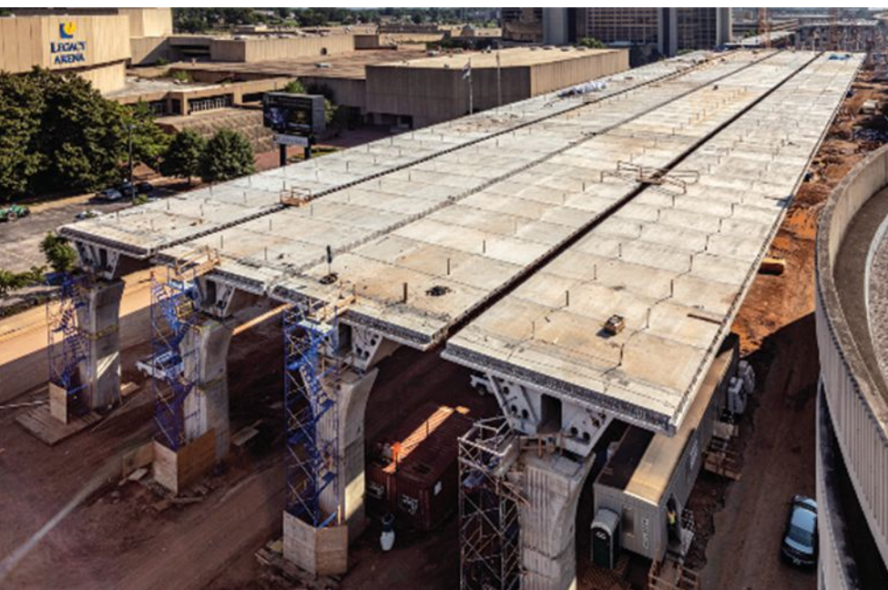
Load rating of the new 172-span, 1 million ft 2 structure for the Interstate 20/Interstate 59 Central Business District Bridges in Birmingham, Ala., required over 160,000 individual rating evaluations.