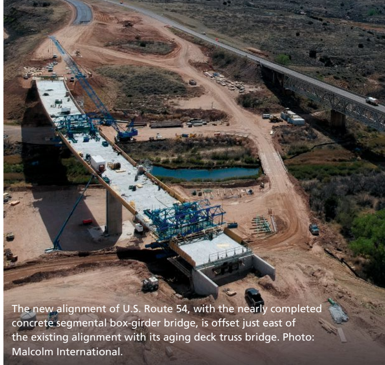
The new alignment of U.S. Route 54, with the nearly completed concrete segmental box-girder bridge, is offset just east of the existing alignment with its aging deck truss bridge.

by Nyssa Beach, Jacobs Engineering, and Jeff Mehle, McNary Bergeron & Associates