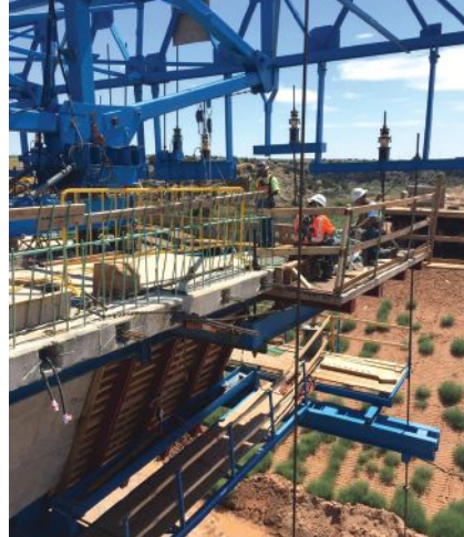
Formwork being set in preparation for casting the next box-girder segment.

During segmental construction, representatives from NMDOT, the design