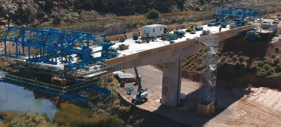
Form travelers at either end of cantilever 1. Geometry control and monitoring during segment casting ensured accurate vertical and horizontal alignments.