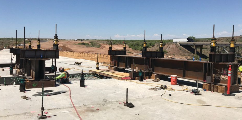
Closure beams were used to align and grade the cantilever tips and end spans for casting the closure sections.

friction and wobble were compared with the actual observed coefficients measured in the field, with field friction tests and elongation compared with force results for each length of tendon. Additionally, post-tensioned tendon tensioning results were tracked to identify elongation trends during the progression of the cantilever segments. The cantilever tendon elongations during construction were compared to an allowable \pm 7\% tolerance on the elongation difference between actual and theoretical values. This was valuable in recognizing trends to anticipate and understand the results and quickly address any anomalies.