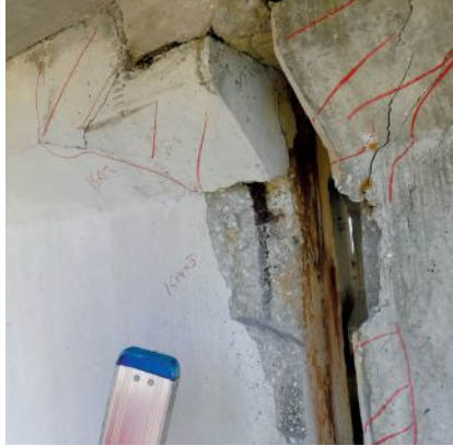
Cracks and spalls being measured and documented during a bridge inspection.

background in bridge design, and most are licensed professional engineers. Bridge inspectors are required to pass a two-week training class and then get recertified every two to five years, depending on the state they work in. Often working in two-person teams, they are trained to work safely in dangerous environments, both natural and artificial, and they are prepared to communicate technical data in challenging situations. Bridge inspection is not work that is taken lightly, and states demand a high level of competence.