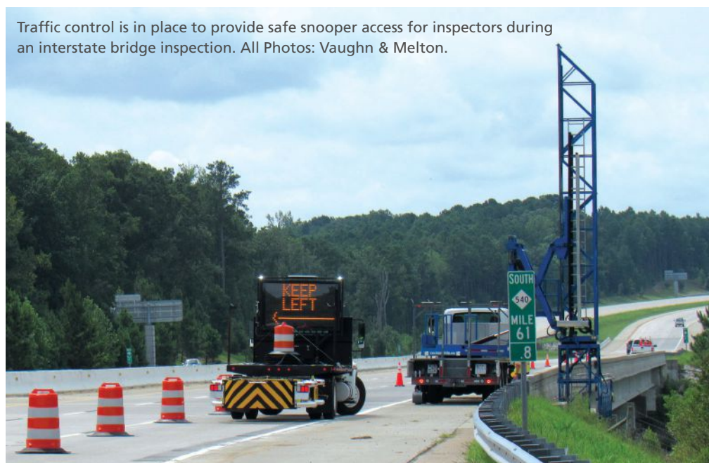
Traffic control is in place to provide safe snooper access for inspectors during an interstate bridge inspection.

Bridge inspection is not just about preventing collapses to save lives. It is a part of a larger program designed to assess the condition of our bridges and identify problems while they are minor and easy to repair. The data collected in bridge inspections are used to establish