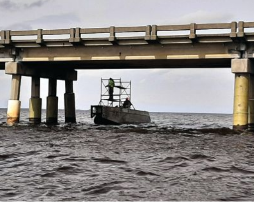
Bridge inspectors are trained to work safely in dangerous environments and to communicate technical data in challenging situations.

the condition of each and every part of a bridge so that owners, usually state departments of transportation or other local agencies, can direct their funding to address key small problems before they become big problems. The data are also used to help determine exactly how much load aging bridges can support so that heavy vehicles do not cause damage to those structures. Bridge inspection not only saves lives but also collects the data needed to ensure that our tax dollars are spent carefully and thoughtfully to maximize bridge service life at the lowest reasonable cost. Bridge inspection is about safety, maintenance, setting the right priorities, and ensuring proper loading of our bridges.